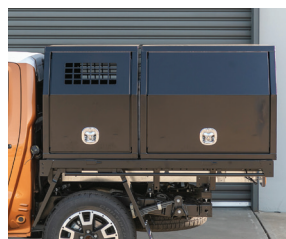
1100mm long with optional Dog Box