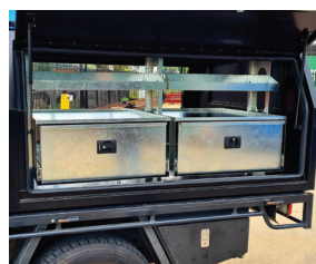
Drawer units with shelf