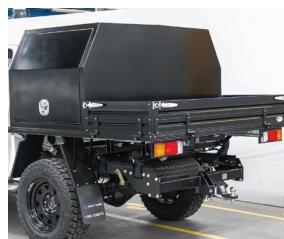
1100mm canopy with rear sides