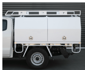
Standard front and rear step