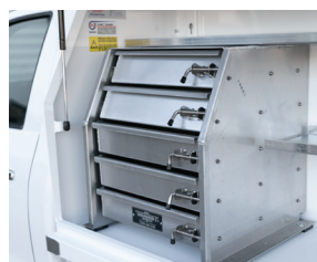
Optional drawer fitment