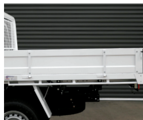
Full length welded tie rail