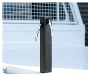
Removable rear corner post / anti-rattle latch