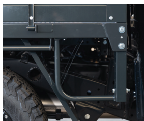
Front step (not available on dual cab)