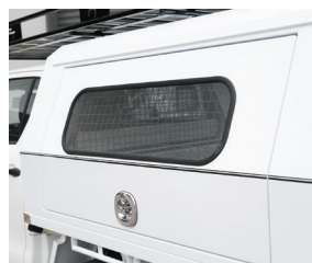
3 point T-handle locks