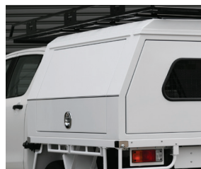
Optional window delete