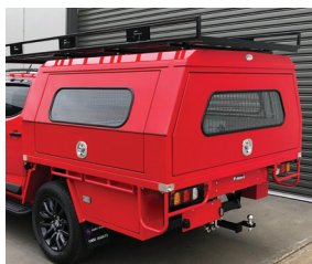
Optional Colour coding