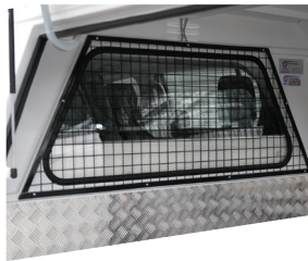
300mm internal lining with security mesh