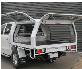
Gullwing style opening doors